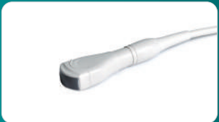
C322V Micro-convex probe • 2-7 MHz • Cardiac • Abdominal