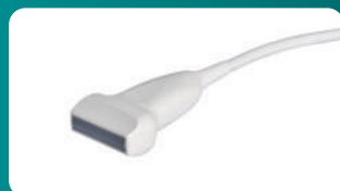
L741 Linear probe • 4-16 MHz • Small parts • High res. abdominal

As the first company engineered both medical ultrasound units and transducers in China, SonoScape offers a broad range of transducers for E3V, helps to provide exceptional image quality in animal care.