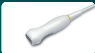
7P-B High frequency phased array probe • 2-9 MHz • Small animal • Cardiac