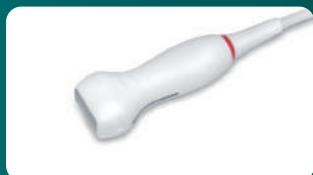
3P-A Phased array probe • 1-6 MHz • Cardiac • Abdominal