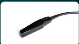
L741V Linear transrectal probe • 4-16 MHz • Reproduction • Large animal