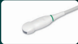
C613 Micro-convex probe • 4-13 MHz • Abdominal • Cardiac • Ovum pick-up