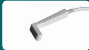
10I2 Intraoperative probe • 4-16 MHz • Ophthalmology • Superficial