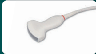
3C-A Convex probe • 1-7 MHz • Abdominal • Reproduction • MSK