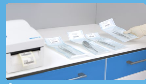
✓ Marking with MELAprint 80