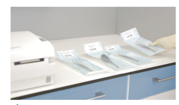
✓ Labelling with MELAprint 80