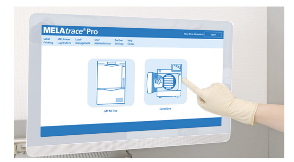
✓ Documentation & approval with MELAtrace