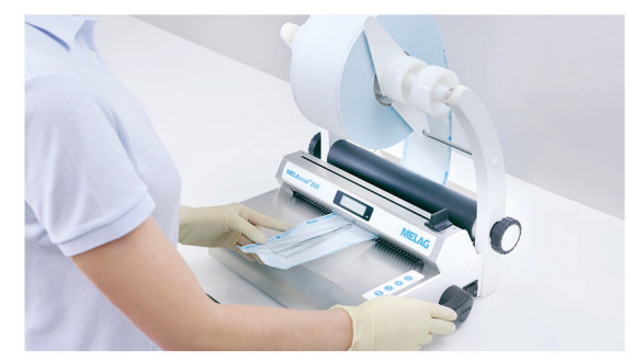
✓ Packaging with MELA seal or MELA store