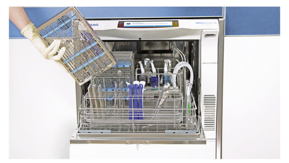
✓ Cleaning & disinfection with MELA therm