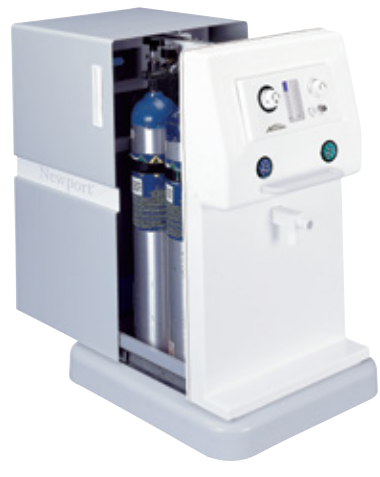
Newport<sup>™</sup> Flowmeter System

An enclosed portable keeps the cylinders out of sight and makes operatory turnaround (disinfection) faster and easier. The flat surface of the enclosed portable can be used as additional counter space.