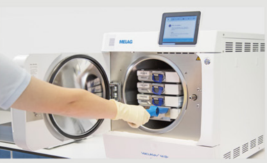
Sterilization with MELAG autoclaves