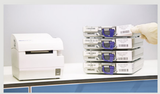
Labelling with MELAprint® 60