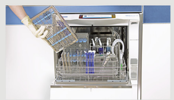
Cleaning and disinfection of MELAstore<sup>®</sup>-Trays with MELAG washer-disinfectors