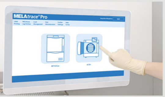
Documentation and approval with MELAtrace®