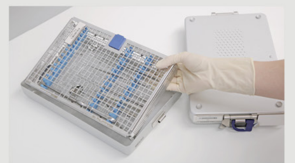
Packaging with MELA store <sup>®</sup>- Boxes