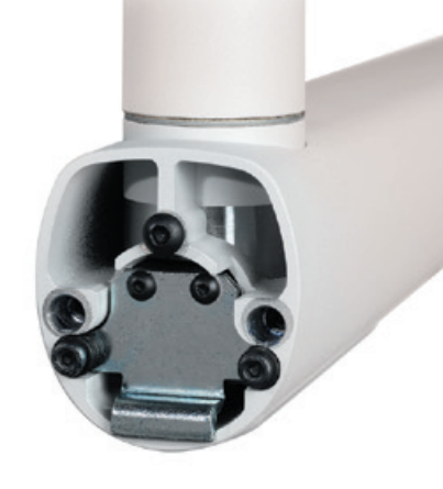
Only Preva offers a dual arm braking system

56", 66", 76" and 82"* arm lengths available *Requires mounting plate