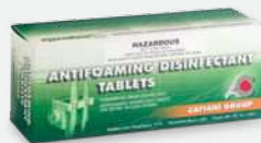
M-140825 Antifoaming Disinfectant Tablets