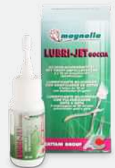
M-040727 Lubri-Jet Lubricant Drops