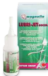
M-040727 Lubri-Jet Lubricant Drops