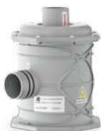
C-160540 HEPA H14 Filter 4-6 Surgeries Housing not included