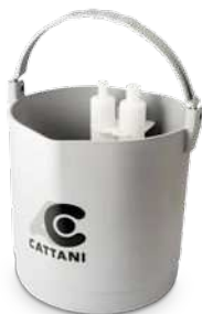
C-040720 Pulse Cleaner Automatic Dispenser