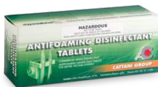
M-140825 Antifoaming Disinfectant Tablets