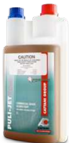
M-060970 Puli-Jet GENTLE Disinfectant Solution