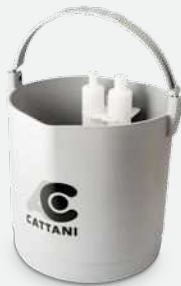
C-040720 Pulse Cleaner Automatic Dispenser