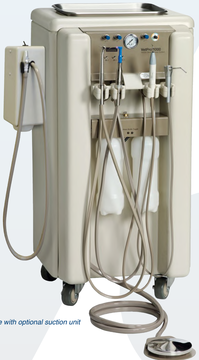
Shown here with optional suction unit