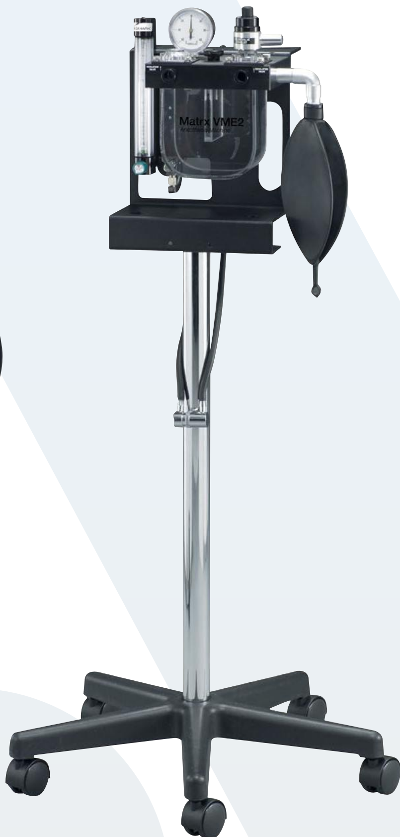
Table top system also available.

The Matrix VME2 places all your anaesthesia equipment on a compact mobile post. You can add shelves, a second flowmeter, second vapouriser, occlusion valve with safety relief and an emergency air intake valve.