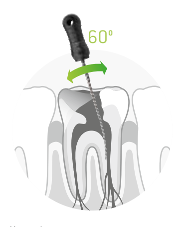
Your advantage: you can carry on using your tried and tested hand files

Use your tried and tested hand files in mechanical root canal preparation with Endo Cursor. Using the »balanced force« technique, the root canal is prepared by the files' reciprocating motion (approximately 60°). This is a similar motion to manual endodontics but the treatment is faster, more cost-effective and easier. The large, powerful light source included in the LT version provides precise illumination for perfect vision, even after many sterilization cycles.