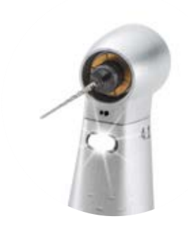
A large, powerful light provides precise illumination while being fully sterilizable