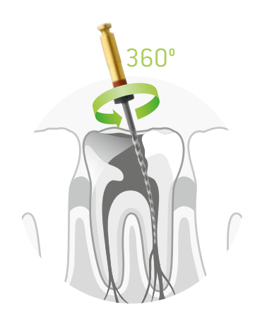
Maximum precision, speed and efficiency through 360° rotation