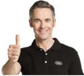
W&H Technical Service

»The better the care, the longer the pleasure.« Regular cleaning and care of your instruments protects them against premature wear and unnecessary service costs.